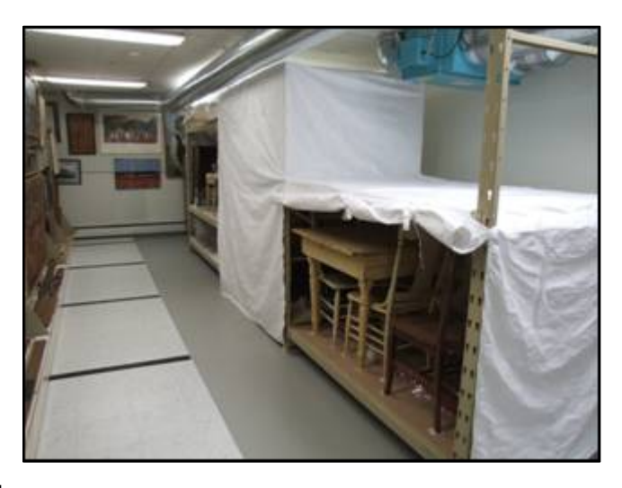
Dust covers purchased in anticipation of the HVAC installation process.

As the museum has not undergone a remodel of this magnitude, museum staff are preparing for contingencies. In anticipation of impacts on museum operations, the museum staff is planning to move and protect the collection. Preparations have included the purchase of cabinets to house